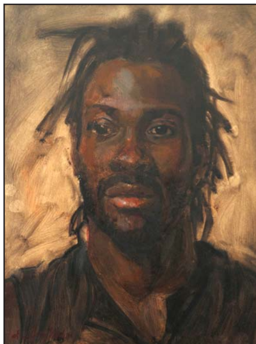
16" x 12"